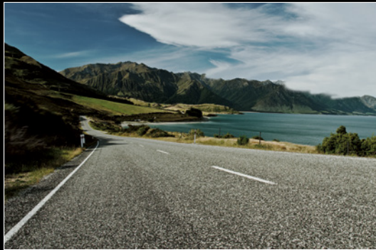
Original background image