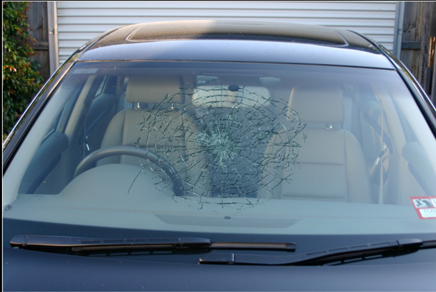
Illustrated placed onto car image