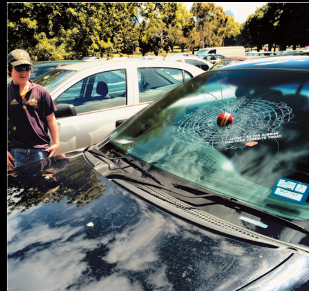
Photo taken at MCG