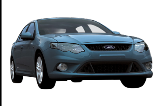
Original car image