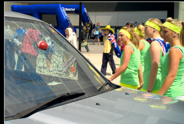
Photo taken at MCG